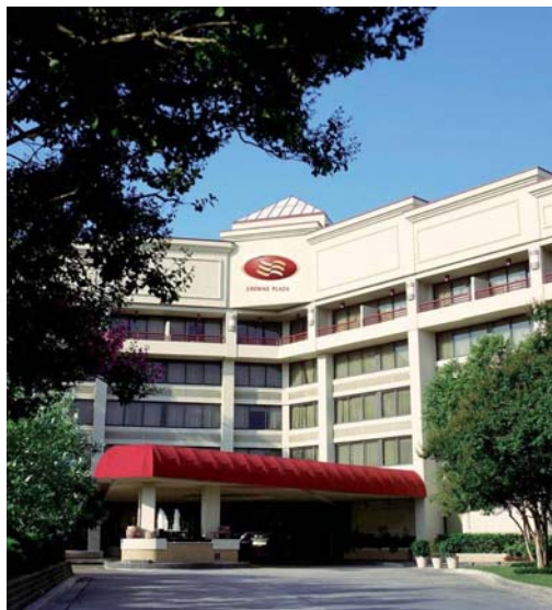
Speaker & LGA Annual Meeting

Registration is now open for the 2014 LGA Annual Operations Conference on October 27-29, 2014 at the Crowne Plaza Hotel in Baton Rouge, LA.